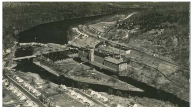
Aerial view of the Baltic Mills site on the Shetucket River prior to the 1999 fire. Building #10 on far right still standing.

The Connecticut Economic Resource Center (CERC) is finalizing an economic feasibility analysis of the Mill's potential through a Rural Business Development Opportunity grant from the USDA.